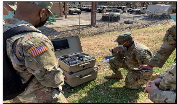
Engineers with problems beyond their capability to solve with in-theater resources are connected with SMEs via reachback through the UROC.